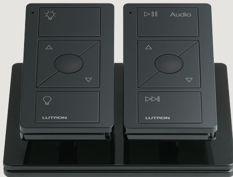
Pico remotes for lights and audio